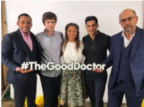
Pictured from left to right (main cast): Hill Harper (Dr. Marcus Andrews), Freddie Highmore (Dr. Shaun Murphy), Antonia Thomas (Dr. Claire Browne), Nicholas Gonzalez (Dr. Neil Melendez), and Richard Schiff (Dr. Aaron Glassman).