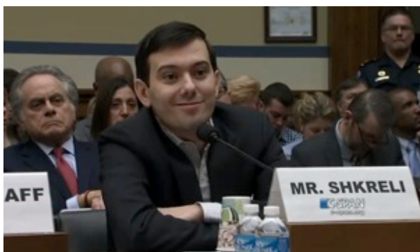
Martin Shkreli, Ex-Pharma CEO, testifying before Congress about the 400% increase in price in the EpiPen.

The Drug Price Transparency bill attempts to