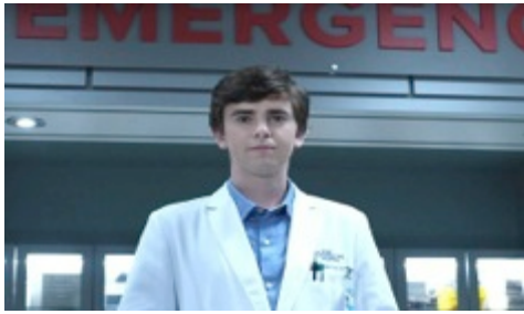
Pictured above is Freddie Highmore playing the role of the surgical resident Shaun Murphy.